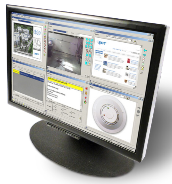
Your compass: EST3's FireWorks Graphical Command Interface.

This means, for example, that during an emergency your system operator can broadcast audio instructions, view live CCTV, and disarm security partitions in order to provide occupants with unencumbered egress – all without taking his or her eyes off the system display. Only Synergy-enabled EST3 with mass notification merges emergency communications with threat detection – and security control – to offer this level of crisis management.